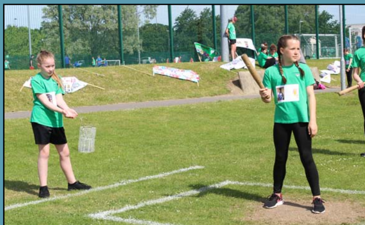
Photo: Rounders on Sports Day