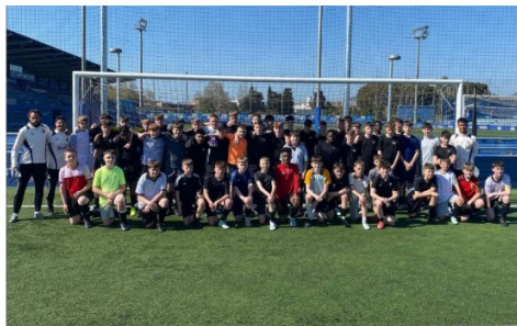
First Professional Training Session