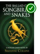
The ballad of songbird... Suzanne Collins. (2020) Dystopian FIC_DYS_COL

RETURNS – Put your book in the special box in your Year Office by the date stamped