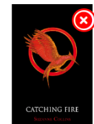
Catching Fire Suzanne Collins (2018) Dystopian FIC_DYS_COL