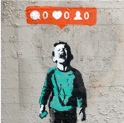
Art with a message— like Banksy