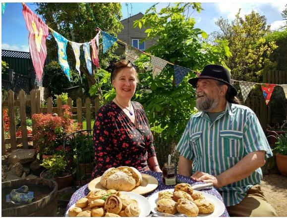
Mrs Webb dressed up and had a garden party.