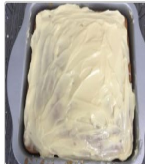
Imogen Walker (8C) made a preserved lemon tray bake for VE Day.