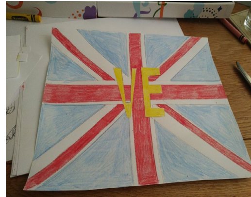
Poppy Wright (9H) interviewed her Grandad and elderly neighbour

On VE day this year, my street had a parade that came down the road (all while social distancing!). Everybody sat on their driveway and people talked across the street. My elderly neighbour that lives a few doors down had a union jack flag in her window and informed me and my family that it was the same flag that she hung in her window on the actual day of VE day 75 years ago. It was still in good condition and she said that it was probably older than that and it may have been used in WW1.