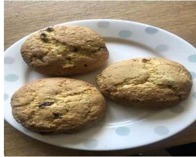
Eve Sambrook (9K) made cookies out of rations.