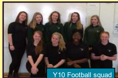
Y10 Football squad