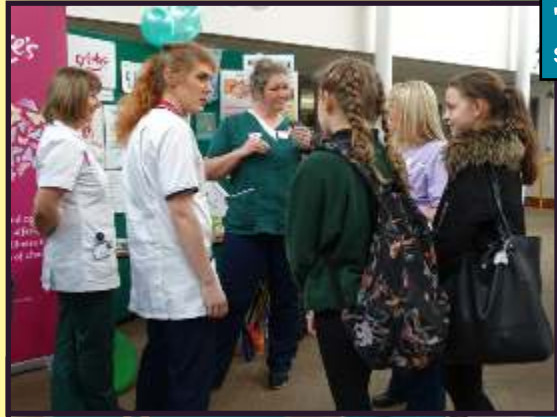
'Market' place information stalls in the Rosling

Of the employers who visited who completed our anonymous survey 100% said the event was worthwhile, as did the school staff. It is always pleasing to hear that 100% of the employers said the students' attitude was positive.