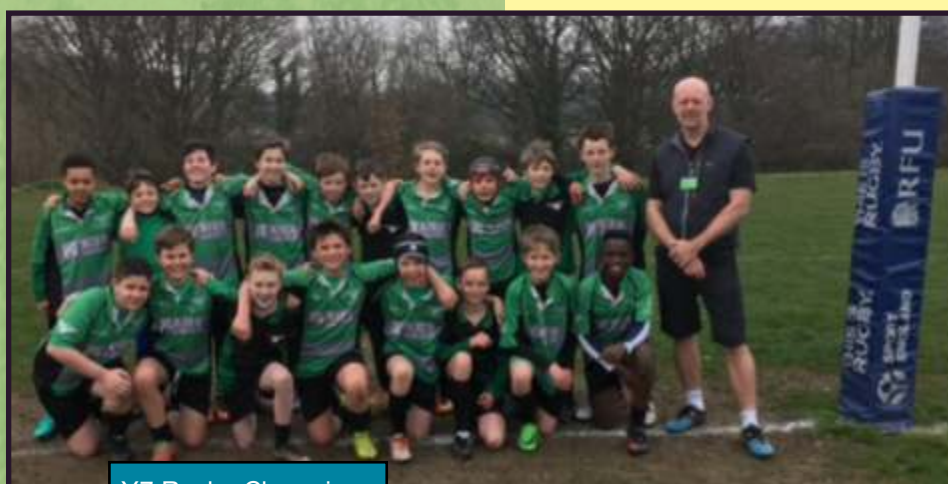
Y7 Rugby Champions