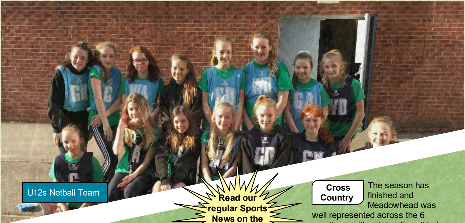
U12s Netball Team