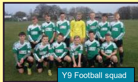
Y9 Football squad