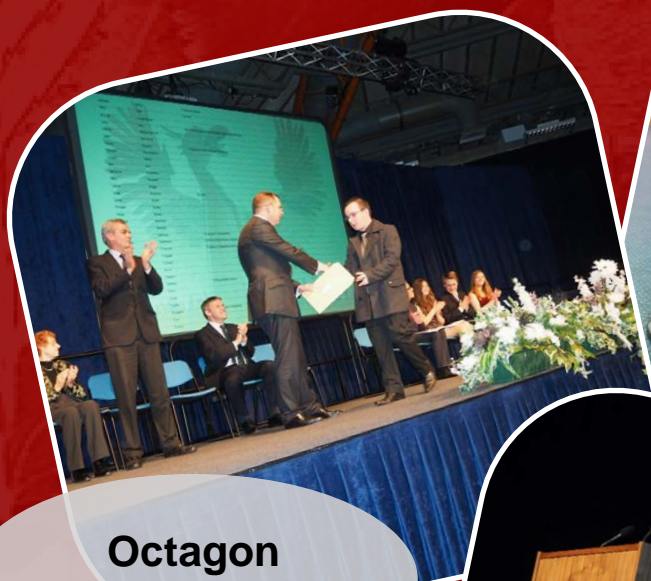
Octagon Presentation 2014

In November we celebrated the achievements of last year's Y11 students at the University of Sheffield's Octagon Theatre. Students' families and school staff enjoyed the presentation of GCSE Certificates and Awards.