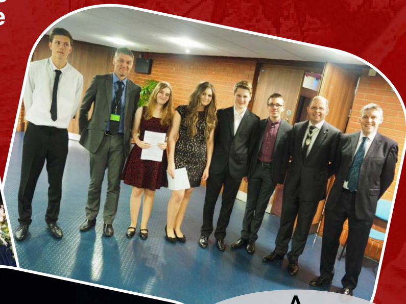
A Celebration of Success!

In November we celebrated the achievements of last year's Y11 students at the University of Sheffield's Octagon Theatre. Students' families and school staff enjoyed the presentation of GCSE Certificates and Awards.